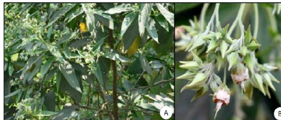
Ching Hawaii Maton (Trichodesma Kumareum)